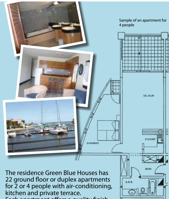
Sample of an apartment for 4 people

The residence Green Blue Houses has 22 ground floor or duplex apartments for 2 or 4 people with air-conditioning, kitchen and private terrace. Each apartment offers a quality finish and detail in its design.